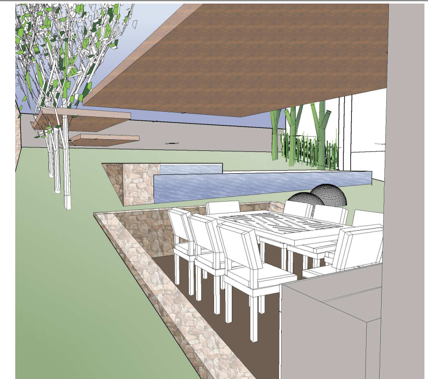
Design Perspective of sunken lounge & rim flow beyond